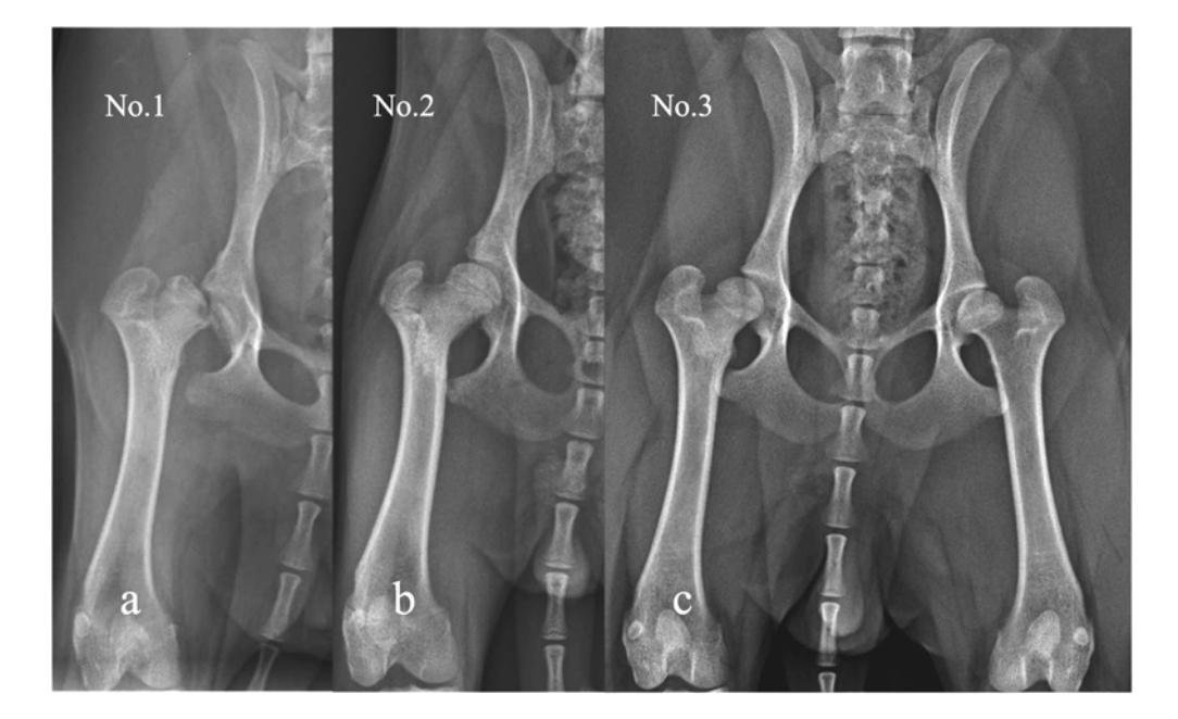
Fig. 1: Dog No.1: Ventrodorsal X-rays view of the right hip joint of a 7-month-old, female, 3.6 kg, Portuguese Podengo. Extensive fragmentation of the femoral head, discontinuity of the articular surface, and diffuse increase of density of the femoral head and neck are evident. Dogs No.2 and No.3: Comparable radiographic appearances in a 6-month-old, female, 2.1 kg and a 8-month-old, female, 3.8 kg. The contour of the femoral head and neck is normal without any evidence of collapse and flattening of head. Multiple foci of radiolucency are present in the femoral neck (No.2), or a single focus in the femoral head (No.3), and a large area of increased density occurred in the proximal femoral metaphysis. The joint space is widened and there is a moderate joint incongruence. In the case No.2 the growth plates are still visible.

The case No.3 was re-examined at 2, 4, and 6 months after diagnosis. At 2 months the owner reported an improvement of walk and behavior of the dog. At 4 months, lameness was not present and manipulation of hip did not elicit pain. At 6 months the dog showed a full recovery, and the pelvic radiography revealed normal trabecular pattern (Fig. 2c).